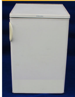
46. Refrigerator 80 x 80 x 100 cm