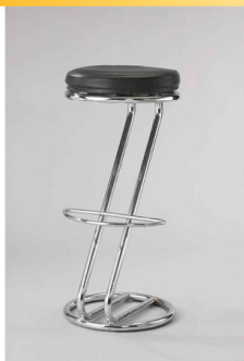
28. Black bar chair