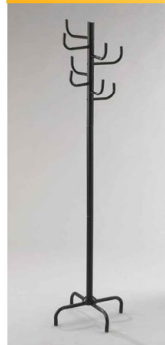
48. Clothes hanger