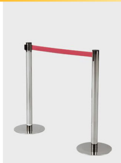
45. Poles with sliding belts 2,3 m