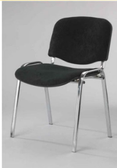
22. Chair chrome / black