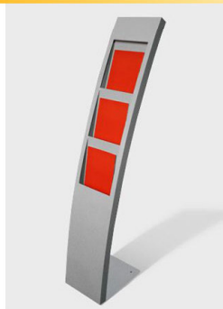
49. Stand for brochures