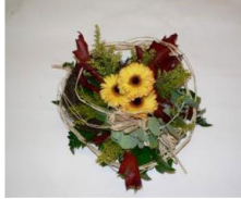
50. Ikebana small