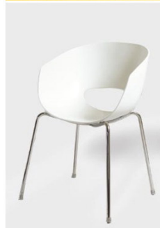
23. Chair design white