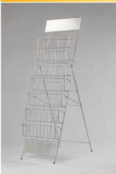
50. Stand for brochures A