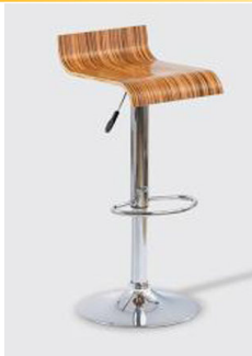
26. Wooden bar chair