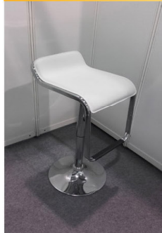
27. Black design bar chair