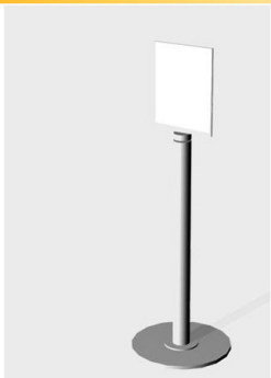
47. Pole with a holder