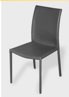
24. Chair leather anthracite black or white